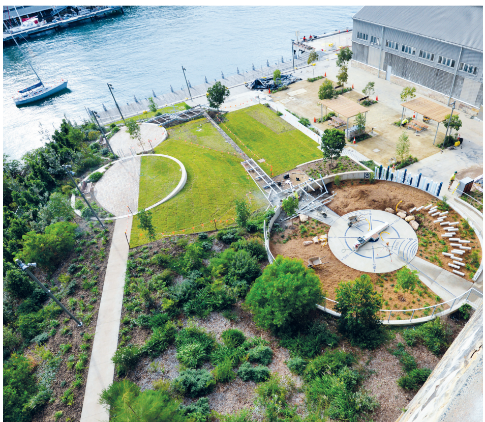
Pictured: Construction in progress of the new pocket park.

We encourage you to walk or cycle to the site as there is no onsite public parking.