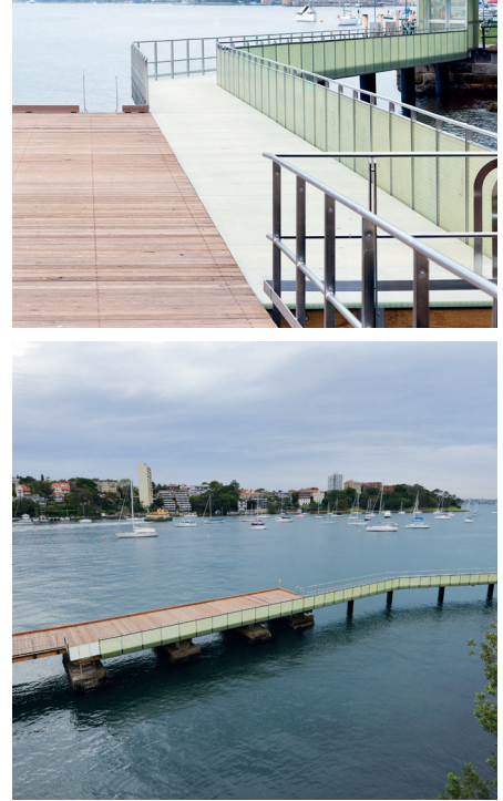
The new overwater link.