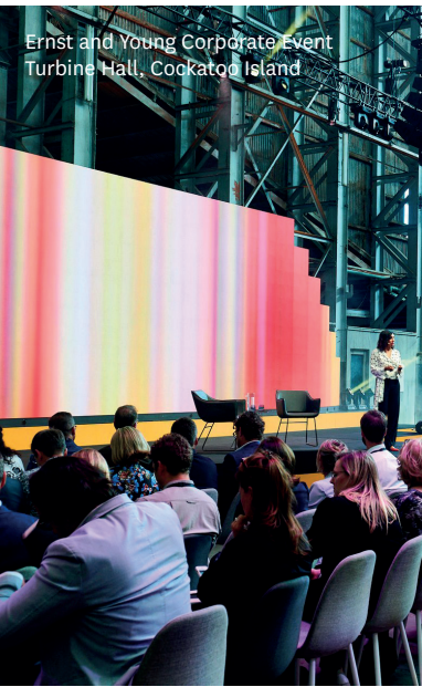
Ernst and Young Corporate Event Turbine Hall, Cockatoo Island

A guide for venue hirers and event organisers