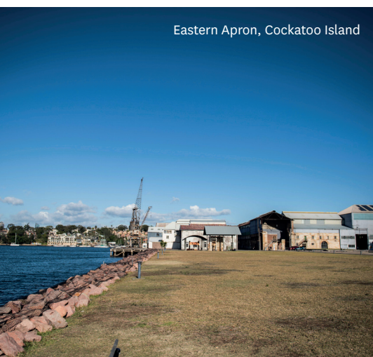
Eastern Apron, Cockatoo Island