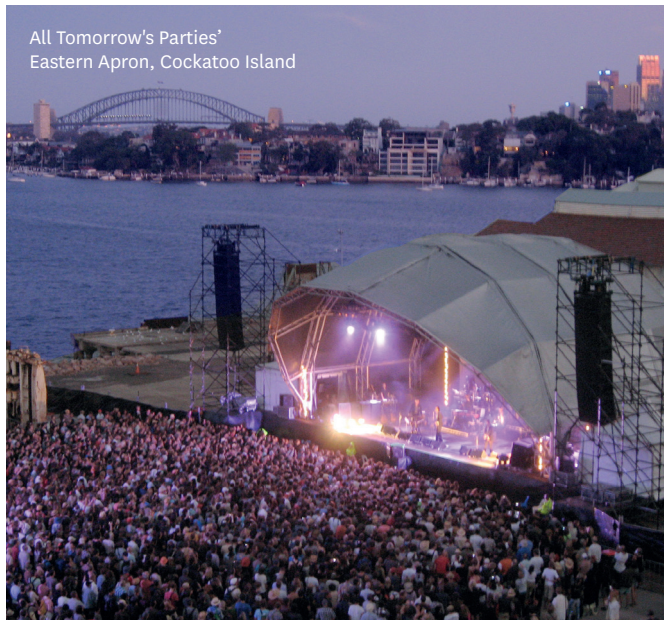
All Tomorrow's Parties' Eastern Apron, Cockatoo Island