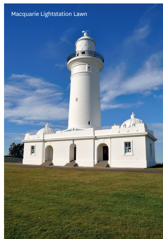
Macquarie Lightstation Lawn