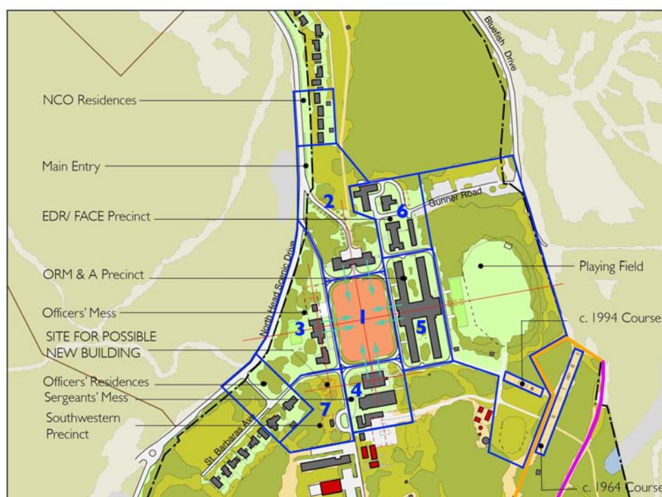
Figure 9.1 Zoning Permissible Development

Zone 7: Redevelopment under strict controls regarding height, density and design