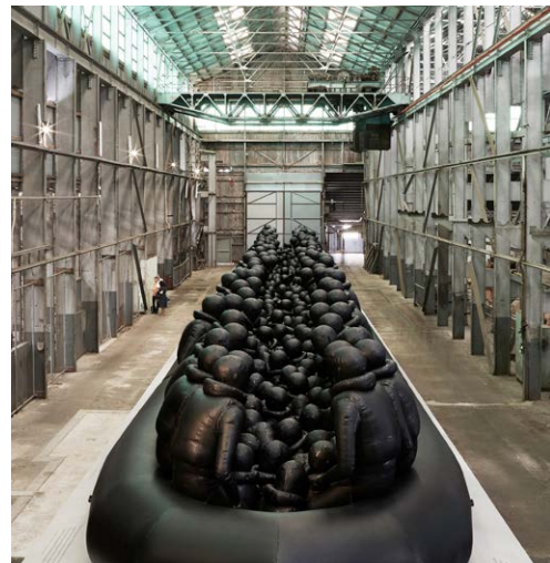
Photo credit: Law of the Journey , Ai Wei Wei, 2017, reinforced PVC with aluminium frame, featured at the 21 st Biennale of Sydney, Cockatoo Island.

Whilst undoubtedly successful in driving visitation and creating vibrancy on Cockatoo Island (Wareamah), the delivery of the Biennale stretches the current resourcing capabilities of the Harbour Trust. We would like to be able to produce expanded site programming and event curation to further promote our sites, however current financial and organisational capacity constraints preclude the Harbour Trust from being able to pursue this path.