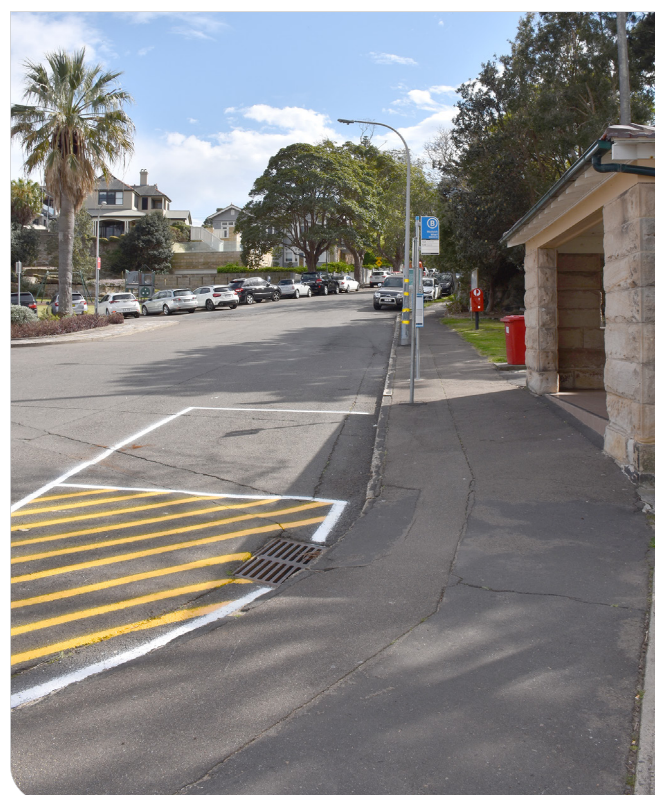
Existing bus stop and shelter at Woolwich Wharf