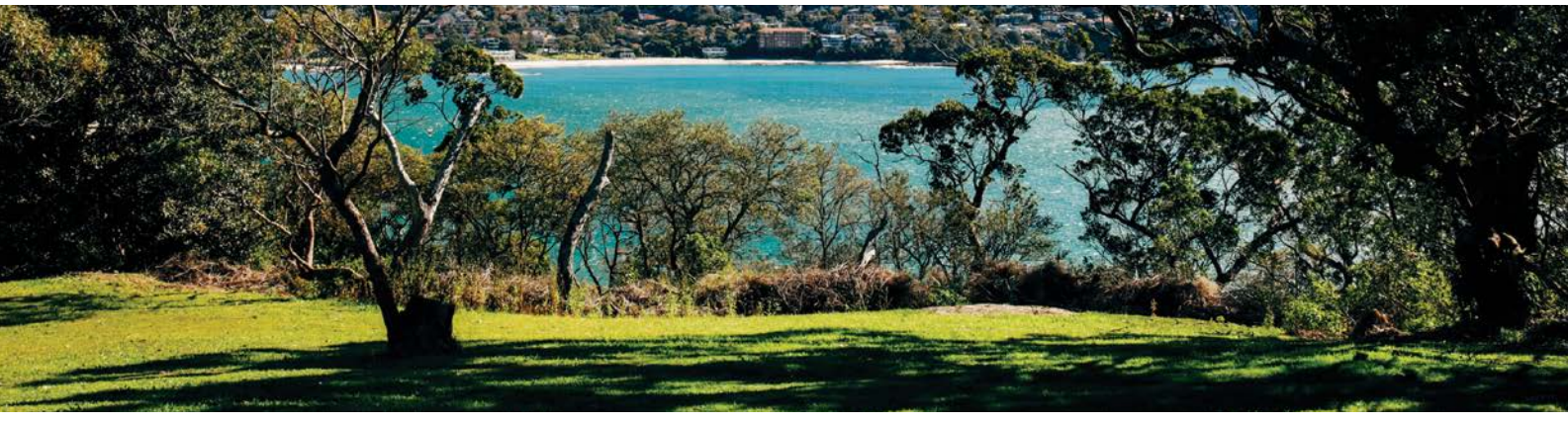
View of Middle Harbour.