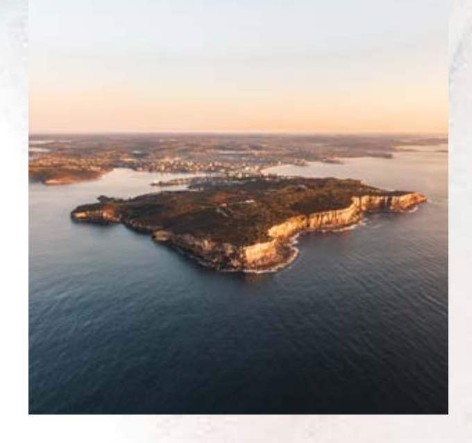
Aerial view of North Head

"We have five song lines that extend out across the Country from here. The Black Duck (Southern) Songline, The Black Swan (Northern) Songline, The Negation (Southwestern) Songline, The old Woman (Western) Songline and the Pelican [Warrigal] (Northwestern) Songline." Excerpt taken from – What the Colonists Never Knew, Professor Dennis Foley National Museum of Australia Press, 2020