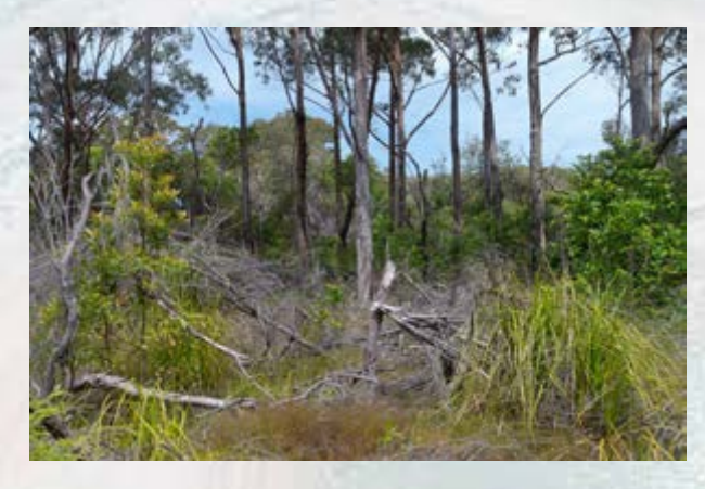
Wilderness at North Head Sanctuary