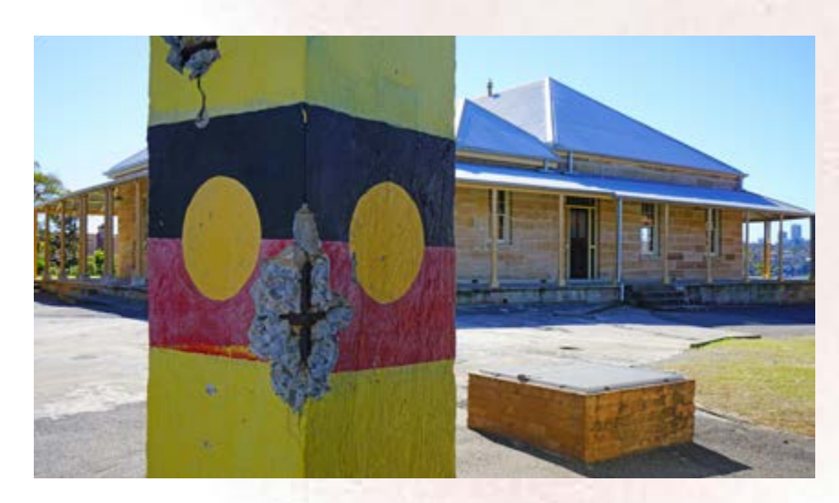
Existing structures on Wareamah

Stakeholders also discussed the importance of preserving the existing cultural remnants on the Island including those from pre-colonial times, and those that were created in post-colonial times. One stakeholder expressed, "please mark and protect the rock carvings etc. Please also respect and encourage visitors to respect the women's-only and/or men's-only spaces."