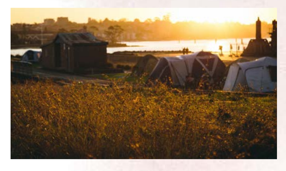
Cockatoo Island (Wareamah)

Stakeholder sentiment was mixed with regards to the clan/totem poles. The concept of acknowledging multiple clan groups in a sculpture as being significant to Wareamah was broadly well received, however it was noted that the way in which the Draft Concept Vision presents this concept is represented as appearing like totem poles. Totem poles are not something that is used by local First Nations peoples with one Traditional Owner sharing "clan poles are not our way" and another asking "where does the idea come from, make sure it is not appropriating another First Nations Country. Who are the four clans?".