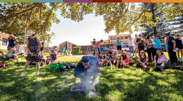
North Head Sanctuary Discovery Day, 2018, First Nations Smoking Ceremony.

Please note: Tours include bush tracks, steps and uneven ground. A moderate level of fitness and good mobility is required. Visitors must wear enclosed footwear (and wet weather gear if required). Minimum and maximum participant numbers per tour apply. Please allow time to book in prior to the tour start time.