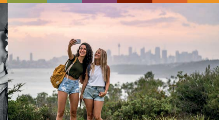
Sanctuary Lawn (Map ref 6F).