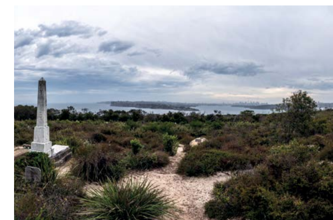
Harbour and city views from Third Quarantine Cemetery (Map ref 4/5F).