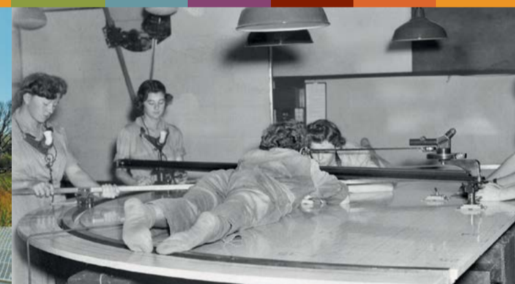
Members of the Australian Women's Army Service performing Plotting Room duties (1944).