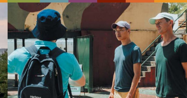
No 2 Gun Emplacement (Map ref 6E).