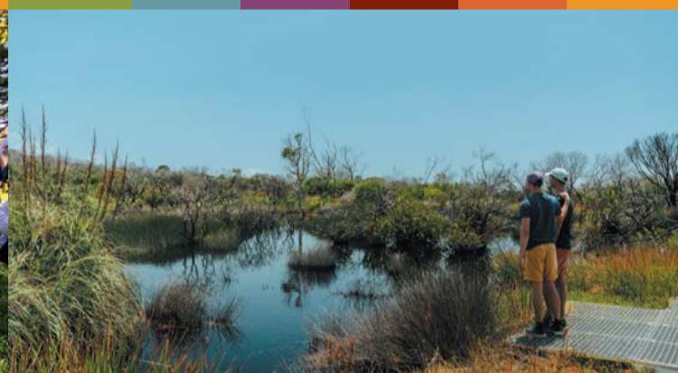
Hanging Swamp (Map ref 7D).