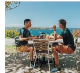
Bella Vista Cafe.

Located in the Barracks Precinct next to WOTSO, Yorky Coffee serves takeaway coffee, beverages and snacks out of a charming 1976 retro caravan.