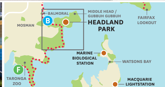
Above: Location image.

Set in one of Sydney's most beautiful hidden gems, this unique 21.9m 2 health practitioner or office space is surrounded by pristine bushland and breathtaking Harbour views.