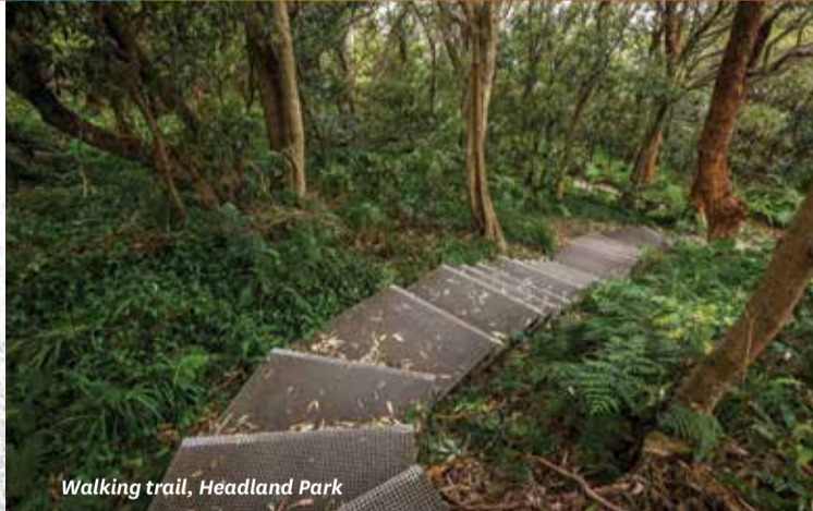
Walking trail, Headland Park