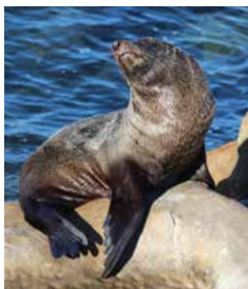
A visiting Fur Seal in Chowder Bay