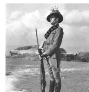
Soldier (name unknown) in Middle Head

And don't miss the Hospital on the Hill exhibition in Building 21. ( Map ref 3G ) Read stories of the staff and recovering soldiers of Australia's third largest military hospital, built here in 1916 to treat WWI casualties returning from the trenches of the Western Front.