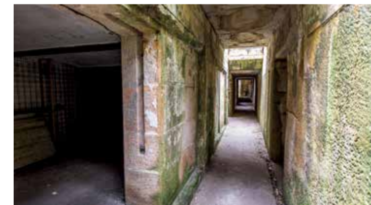
Georges Head Battery

Visit our website for dates and to book.