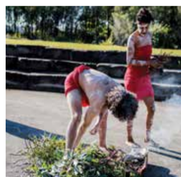
Performers from Diramu Aboriginal Dance and Didgeridoo at the Harbour Trust Innovate Reconciliation Action Plan (RAP) launch, 2018

These First Nations settlers were not Borogegal, but were from the Broken Bay area and Macquarie appointed Bungaree, to be their chief. Bungaree has been described as witty, intelligent and something of a diplomat and is recognised as an example of significant collaboration between First Nations and Europeans.