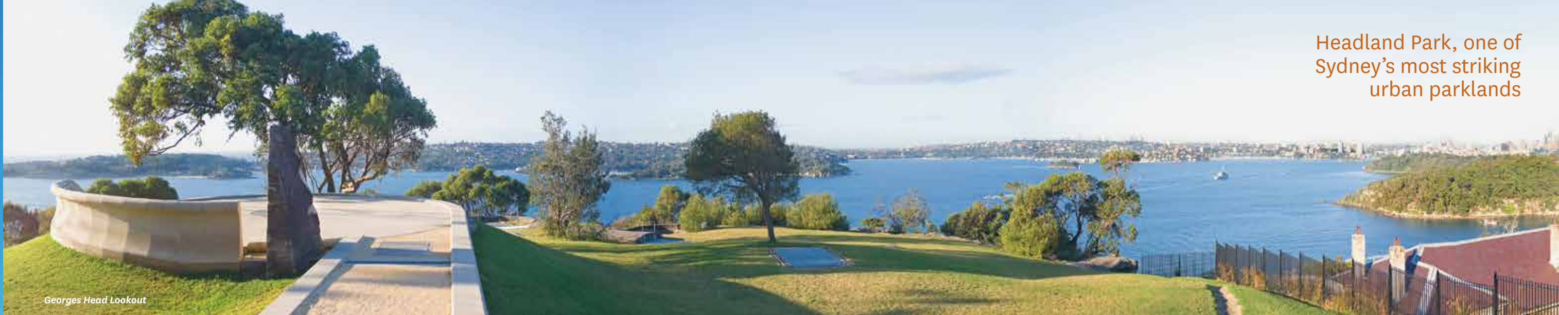
Georges Head Lookout

Headland Park, one of Sydney's most striking urban parklands