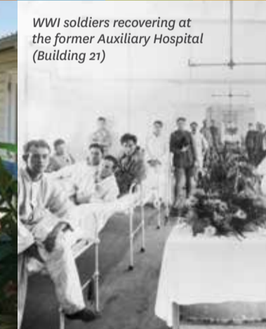
WWI soldiers recovering at the former Auxiliary Hospital (Building 21)