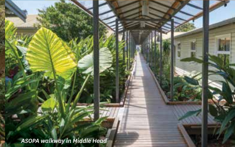
ASOPA walkway in Middle Head