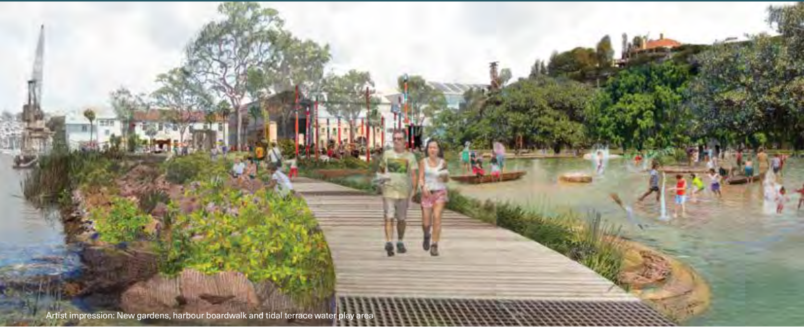
Artist impression: New gardens, harbour boardwalk and tidal terrace water play area

Have your say about the future of Cockatoo Island / Wareamah