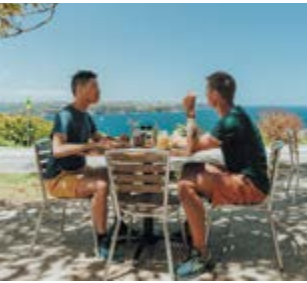
Bella Vista Cafe.

Located in the Barracks Precinct next to WOTSO, Yorky Coffee serves takeaway coffee, beverages and snacks out of a charming 1976 retro caravan.