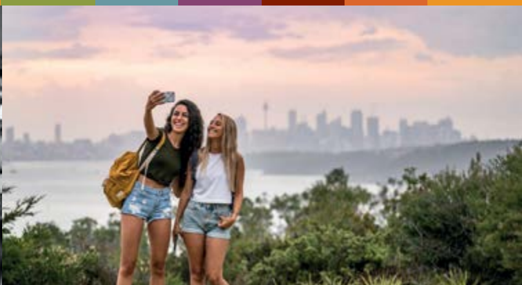
Sanctuary Lawn (Map ref 6F).