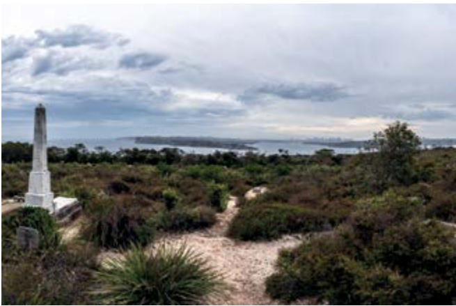
Harbour and city views from Third Quarantine Cemetery (Map ref 4/5F).