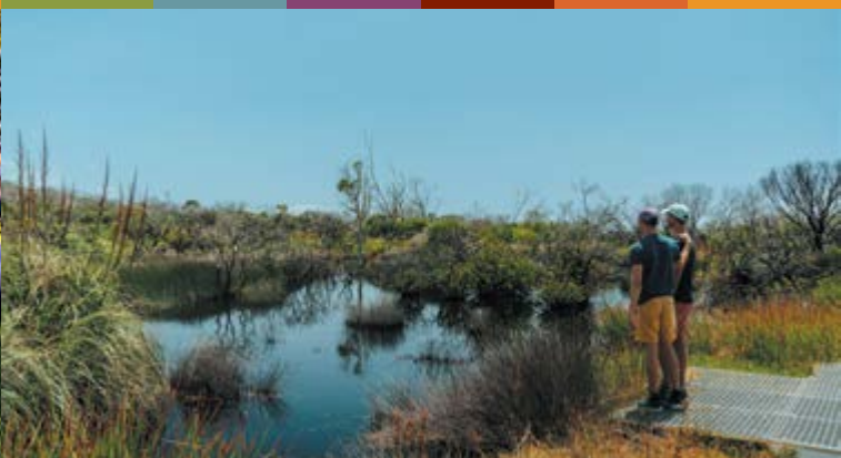
Hanging Swamp (Map ref 7D).