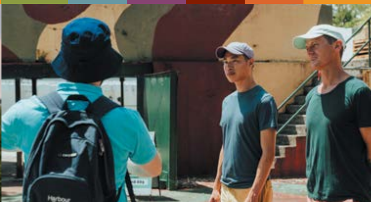
No 2 Gun Emplacement (Map ref 6E).