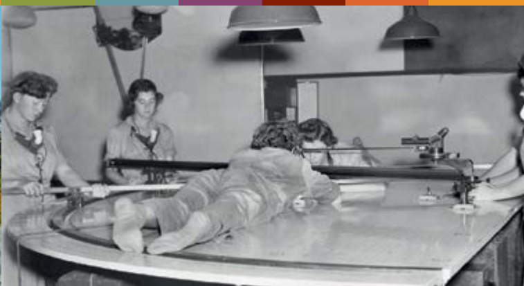
Members of the Australian Women's Army Service performing Plotting Room duties (1944).