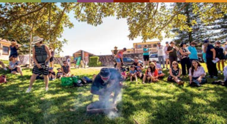
North Head Sanctuary Discovery Day, 2018, First Nations Smoking Ceremony.