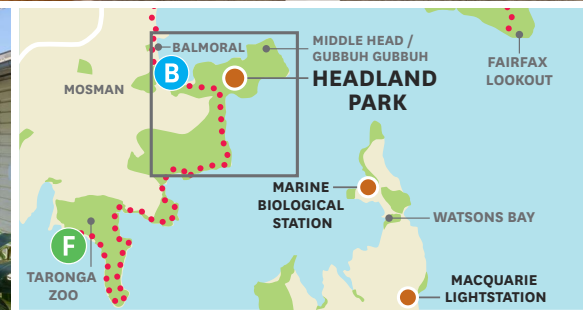
Above: Location image.

Originally constructed as barracks during the Second World War, this exclusive complex later housed accommodation and training facilities for the Australian School of Pacific Administration (ASOPA). Now meticulously restored and upgraded, these buildings blend modern amenities with contemporary design, offering an exceptional space for your business.