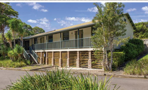
Above: Location image.