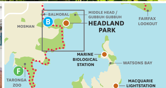
Above: Location image.

This 31.78m 2 office, creative or practitioner space is set in a vibrant, eco-friendly environment nestled in Headland Park, Mosman. This property boasts polished floorboards, air conditioning and an abundance of natural light.