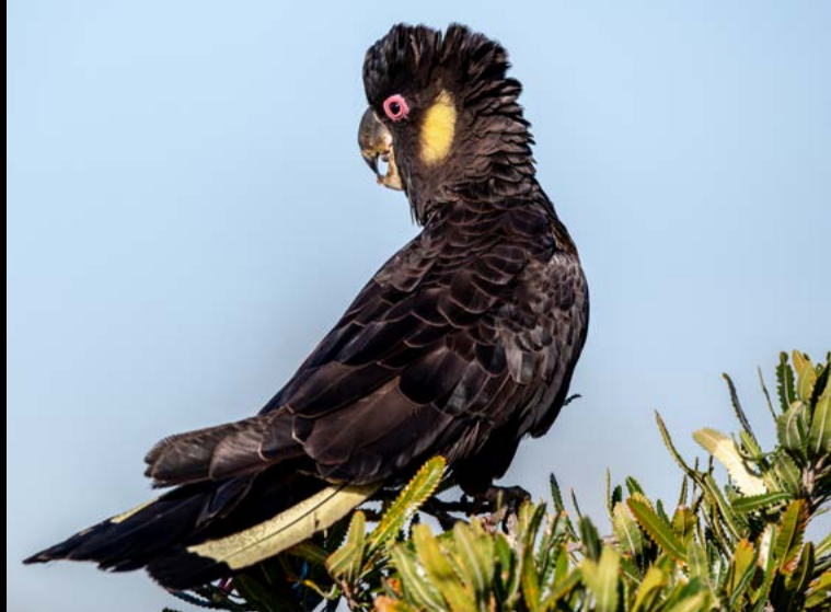
Yellow-tailed black cockatoo

Located in the Barracks Precinct next to the WOTSO coworking space, Yorky Coffee serves takeaway coffee, beverages and snacks out of a retro caravan.