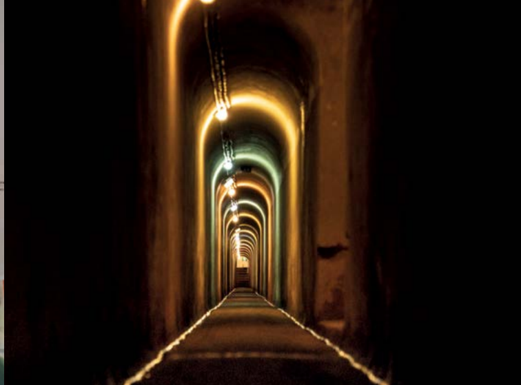
Underground tunnels, North Fort