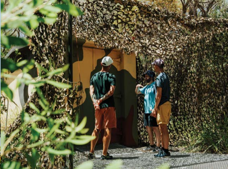
Plotting Room, North Fort