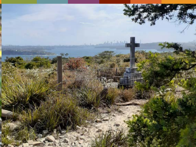
Third Quarantine Cemetery