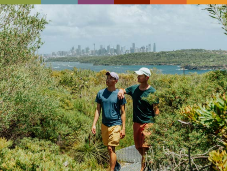
Northern Lookout, Sanctuary Loop

Some tours are available, by request, for private group bookings. To learn more, visit: harbourtrust.gov.au/private-tour-form