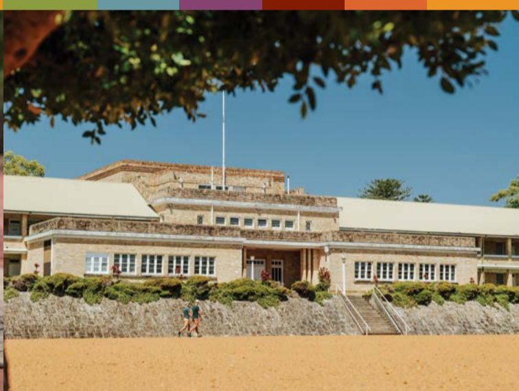
Parade Ground, Barracks Precinct