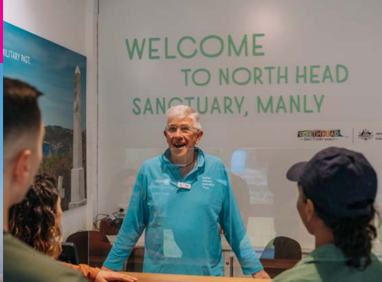
North Head Sanctuary Visitor Centre

NORTH HEAD — SANCTUARY MANLY — Harbour Trust