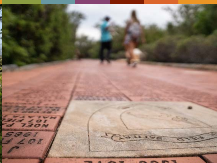
Australia's Memorial Walk